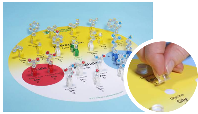
Properties Circle with side chains and clips attached to bumpers

Your Amino Acid Starter Kit<sup>©</sup> includes five improved pieces: Properties Circle, bumpers, side chains with post fitting, plastic clips, and center post and clips.